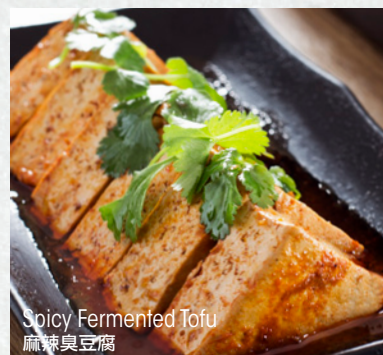
Spicy Fermented Tofu 麻辣臭豆腐