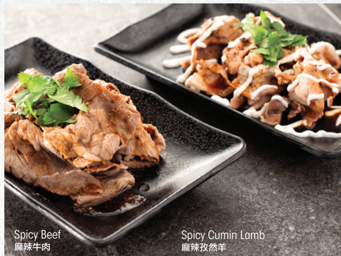
Spicy Beef 麻辣牛肉